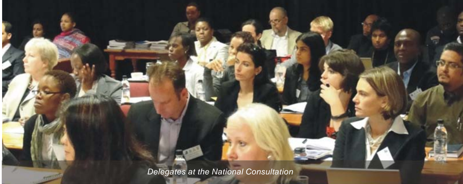
Delegates at the National Consultation

IOM, the National Department of Health, the Forced Migration Studies Programme (FMSP), University of Witwatersrand, and the Joint United Nations Programme on HIV/AIDS (UNAIDS), recently hosted a two-day national consultation in Pretoria on “Realising Migrants’ Right to Health in South Africa.” The conference, which opened on 22 April, brought together key players from the government, international organisations, academia, civil society, and the migrant community, to exchange information and